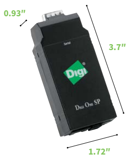
DigiOne® SP - FRONT